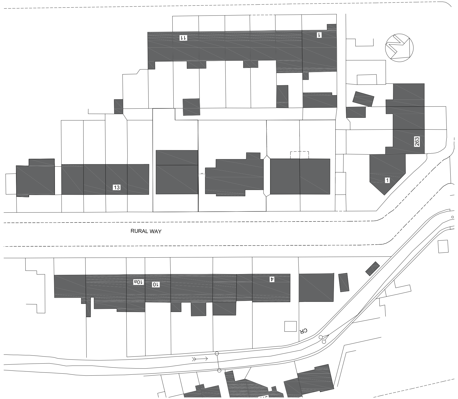
2 / Existing block Plan, 1:500